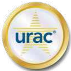
ACCREDITED Specialty Pharmacy Expires 09/01/2025

It is not a valid seal without all three components.